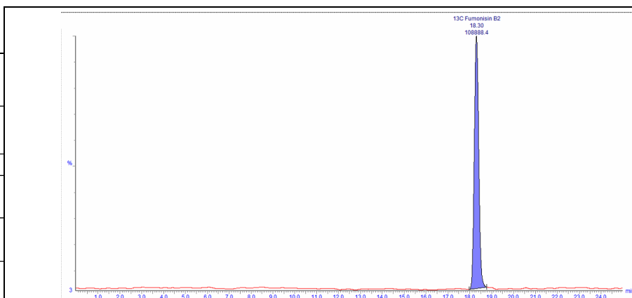
Chromatogram of Toxins